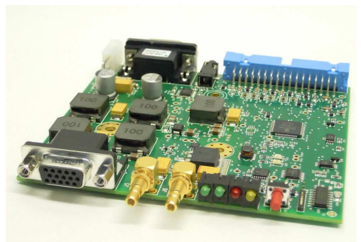
Board MLC-03A-BP1 for OEM lasers using 12V DC