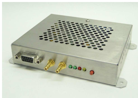
Module MLC-03A-MP1 for OEM lasers using 12V DC