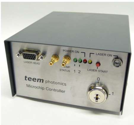
Desktop MLC-03A-DP1 for CDRH certified lasers and 100-240V AC